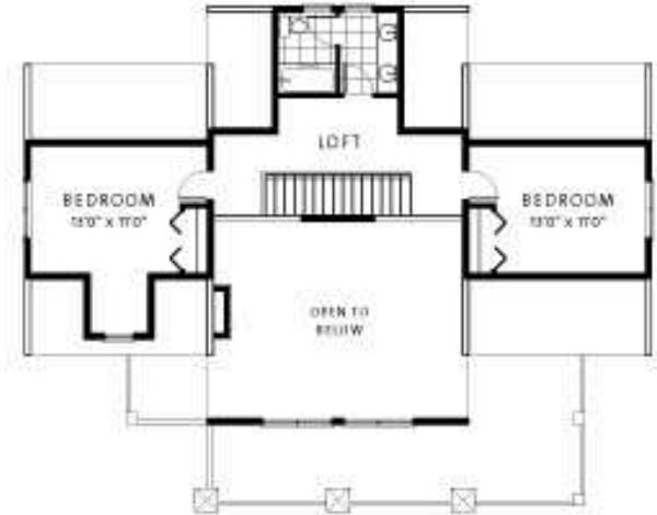
UPPER LEVEL 741 SQ FT (OPTIONAL)