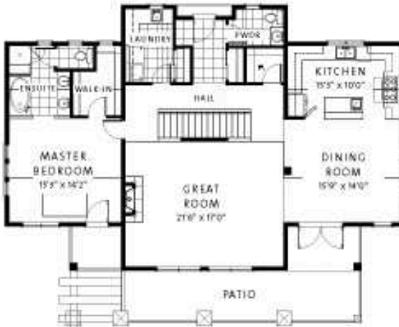
MAIN LEVEL 1,586 SQ FT